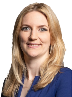
Julia Lopez MP